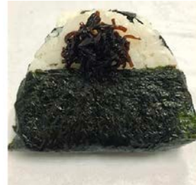
Bento #4 Vegetarian bowl (tofu/eggplant) with konbu musubi