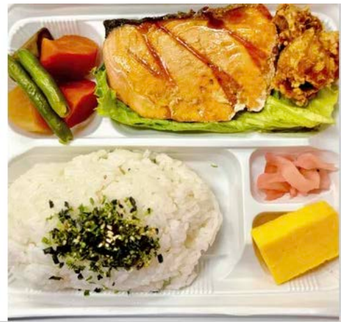
Bento #2: Grilled Salmon Bento with Multigrain rice