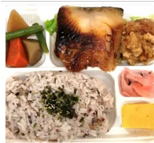
Bento #1: Miso butterfish bento with multigrain rice