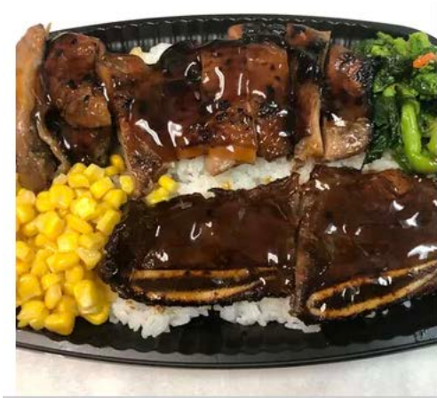
Bento #3; Beef Kalbi & BBQ chicken with white rice